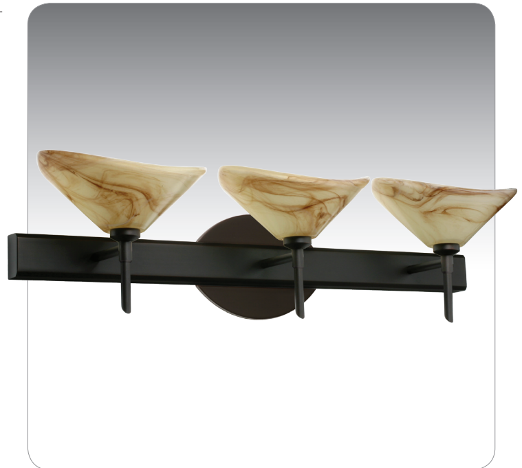
HOPPI SHOWN IN MOCHA (191383) IN BRONZE FINISH

UL or ETL Listed. Suitable for Damp Locations (interior use only).